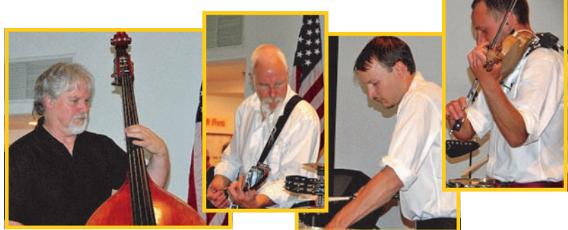
COIN OF THE REALM Entertains