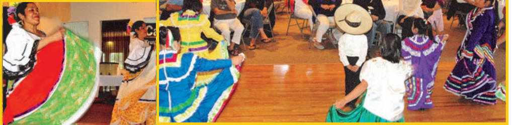
QUETZALCOATL (a non profit school of dance) Entertains